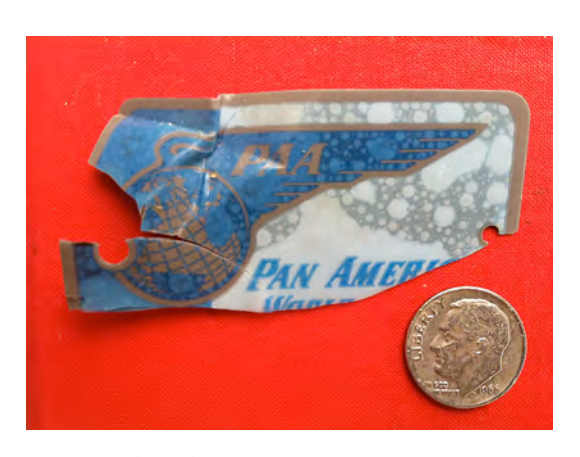
Close up of tag found at Hutchinson Beach, Florida