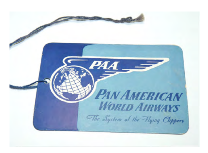
An original Pan Am luggage tag

When Hurricane Cristobal churned its way up the Eastern Seaboard of the U.S. in August 2014, it might have dislodged a remnant of an old Pan American World Airways luggage tag. Coastlines are always in motion - sometimes eroding, sometimes accreting, and today's beach may well be different tomorrow. The sturdy plastic bears the identifiable "winged globe" logo and lettering style used by Pan Am in pre-jet age days - roughly up to the mid-1950's.