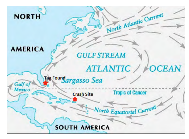
Currents in the Western Atlantic flow northward

It's just possible that the old luggage tag survived the sinking of Clipper Endeavor, and found its way to the Florida beach via the currents that sweep northward from the Antilles, perhaps to be buried and then uncovered years later.